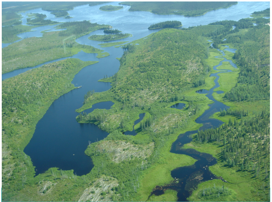
Boreal aquatic ecosystems in northern Québec, where Paul del Giorgio and researchers at the Université du Québec à Montréal are investigating the role these systems play in the global carbon cycle, and the degree to which they influence global climate models.

Continued from page 3 of the Université du Québec à Montréal, aims at filling this major gap in our understanding of northern landscapes. The mission of the CarBBAS Chair is to expand our basic understanding of the function and carbon biogeochemistry of boreal aquatic networks in Northern Québec. The research program aims at 1) developing more robust inventories of aquatic C sources and sinks for these northern landscapes, 2) developing regional empirical and mechanistic models for aquatic greenhouse gas dynamics and carbon storage, 3) understanding the regulation of the key processes involved, and of the influence of landscape and climate change, and 4) scaling up aquatic processes and integrating them at the whole landscape scale. Ultimately, the goals of the Chair are developing and transferring the tools needed to integrate these systems into regional and global C and climate models. The program involves large-scale comparative field studies that integrate streams, rivers, wetlands and lakes across the major eco-regions within the boreal biome of Québec, as well as long-term, detailed processes studies in selected sentinel lakes and rivers. The core group is based in the Dépt. des sciences biologiques of the