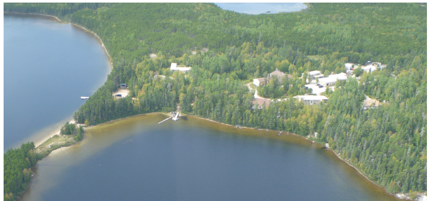
ELA from above

It is difficult to grasp this reasoning behind abandoning the only facility in the world dedicated to whole-lake experimentation, where experiments through the decades have shaped environmental policy domestically and internationally. Experimental manipulation is frequently required to effectively determine causality. Any who have ever been involved in observational/empirical studies know that attempting to tease out "the cause" of ecosystem-level changes is rare, as the data are inherently confounded by many other factors that are