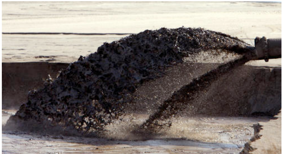
Oil sands tailings entering a holding pond near Fort McMurray, Alberta.

As reported in the Vancouver Sun on June 25, 2012, Minister of Fisheries and Oceans, Keith Ashfield, announced in a letter that the changes to the Fisheries Act in Bill C-38 would enable a simpler mechanism for proponents of development to introduce “deleterious substances” into Canadian waters. Prior to the changes, there were few options available for proponents to introduce deleterious substances (defined as those toxic or otherwise harmful to aquatic ecosystems) besides ministerial approval. Given the prevalence of pictures to the right, as well as the numerous lakes in the Northwest Territories that have been drained for the purposes of diamond mining, this does not appear to have been such a significant hurdle in the first place. Regardless, the Minister indicated that “the amended Fisheries Act will provide flexibility and establish new tools to